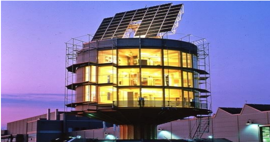
fig 5.1.1: The spinning, sun-chasing Heliotrope designed by Rolf Disch. It can generate up to five times as much power as it needs to operate. The home sports a giant angled solar array on the roof and the entire structure is mounted on a pole timed to rotate 180 degrees each day as it follows the sun.

Both active and passive solar energy are excellent choices in areas with lots of sun and cold weather – like Long Island! Harnessing and transferring solar energy is a cost-effective alternative to using traditional (and expensive) heating sources like electricity or oil, which most of us here on Long Island pay for dearly in the cold winter months.