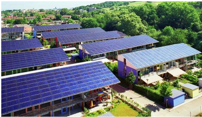
Fig. 3.1: German solar city produces four times more energy than it uses. German architect Rolf Disch one-upped them all by creating an entire solar city. Sonnenschiff in Freiburg is a small community that is entirely powered by the Sun, with rooftop solar panels everywhere you turn. Combined with Passivehaus principles that utilize energy efficiently, the city can generate up to four times as much electricity as it needs.

integrated design approach. It is almost impossible to talk about solar energy in buildings without bringing building orientation to the fore. Dependent on what is to be achieved either minimizing heat gain or maximizing it the building is meant to take whatever orientation the architect deems fit. However, in areas where there is a cluster of buildings probably shielding some other buildings from direct sunlight making it almost impossible for building orientation to be exploited to the fullest, other means of solar energy could be harnessed.