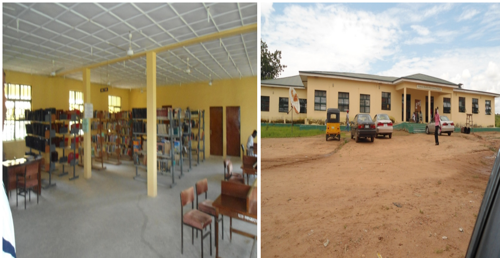
Figure 3a-3b: Professor Mustafa Abba Library (FCE). (1. Ayuba archive)