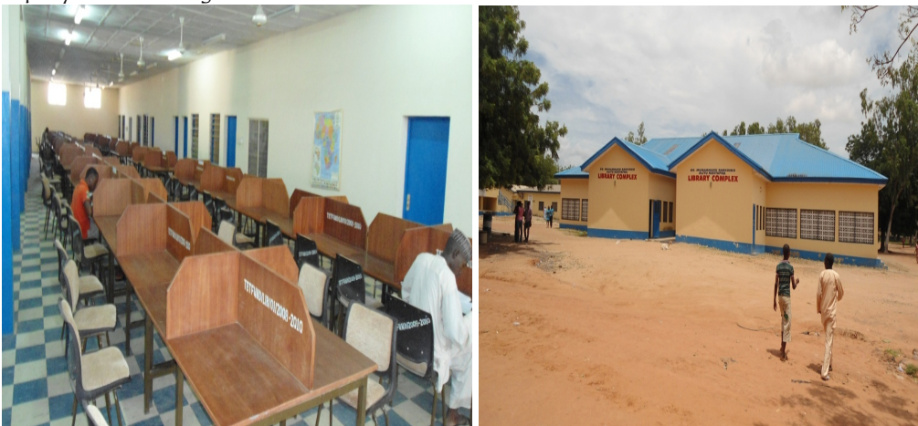
Figure 4a-4b: HRH Dr. Muhammaḍu Barkindo Aliyu Mustapha Library (SPY)

HRH Dr Muhammaḍu Barkindo Aliyu Mustapha library SPY is located along bank road-police round about, Yola north local Government. It is a State Polytechnic Library with Book reserve, a single reading area and office. It is targeted at students, faculties and staff of the polytechnic. (figure 4a-4b).