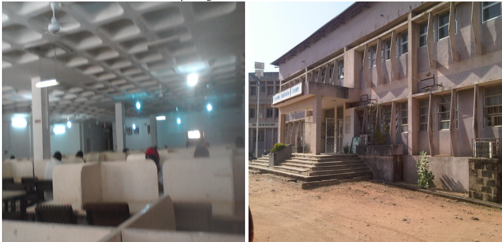
Figure 2a-2b: Ibrahim Badamasi Babangida Library (MAUTECH). (I. Ayuba archive)

Gen Ibrahim Badamasi Babangida Library MAUTECH is located along Yola-Mubi road, Girei local Government. It is a federal university library which is a storey building with server cafe, book reserve, 2 reading spaces, toilets and office. It is targeted at students, faculties and staff of the university (figure 2a-2b).