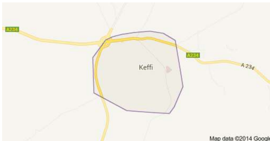
Map of Keffi