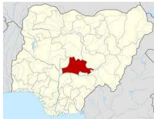
Map of Nigeria Showing Nasarawa