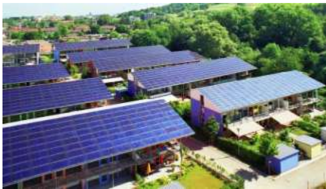
Fig. 3.1: German solar city produces four times more energy than it uses. German architect Rolf Disch one-upped them all by creating an entire solar city. Sonnenschiff in Freiburg is a small community that is entirely powered by the Sun, with rooftop solar panels everywhere you turn. Combined with Passivehaus principles that utilize energy efficiently, the city can generate up to four times as much electricity as it needs.

without bringing building orientation to the fore. Dependent on what is to be achieved either minimizing heat gain or maximizing it the building is meant to take whatever orientation the architect deems fit. However, in areas where there is a cluster of buildings probably shielding some other buildings from direct sunlight making it almost impossible for building orientation to be exploited to the fullest, other means of solar energy could be harnessed.