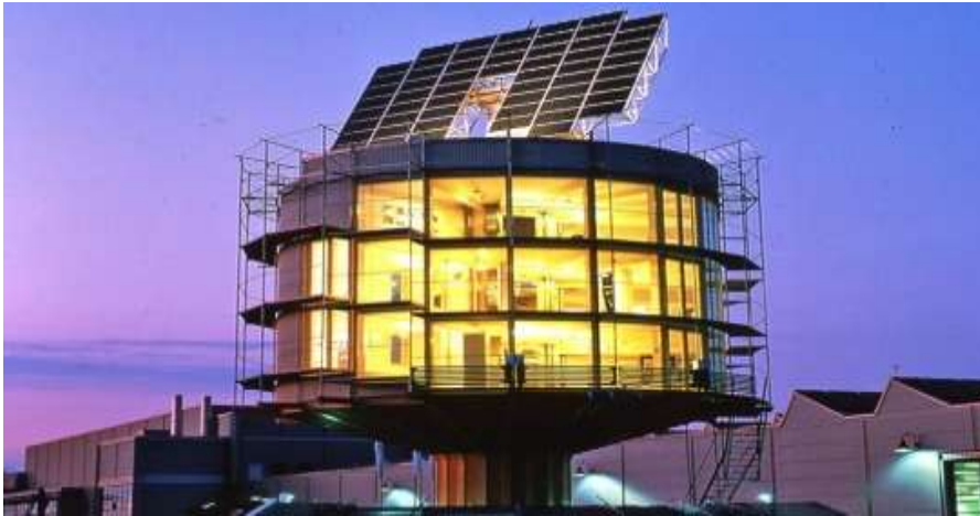
fig 5.1.1: The spinning, sun-chasing Heliotrope designed by Rolf Disch. It can generate up to five times as much power as it needs to operate. The home sports a giant angled solar array on the roof and the entire structure is mounted on a pole timed to rotate 180 degrees each day as it follows the sun.

Both active and passive solar energy are excellent choices in areas with lots of sun and cold weather – like Long Island! Harnessing and transferring solar energy is a cost-effective alternative to using traditional (and expensive) heating sources like electricity or oil, which most of us here on Long Island pay for dearly in the cold winter months.