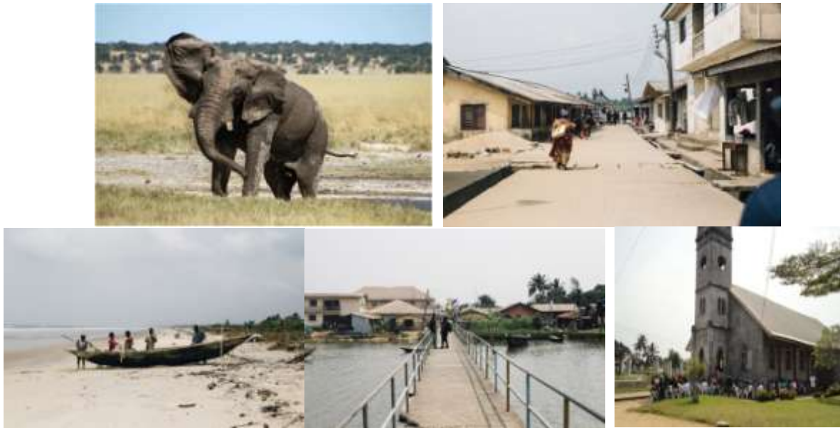
Pictures of popular sites at Ikuru Town respectively; Elephant Reserve, A Street scene, Fishermen by the beach, Ikuru Jetty and St. Thomas church.