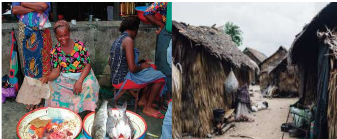
The primary occupation in Ikuru town and Oyorokoto Fishing Settlement