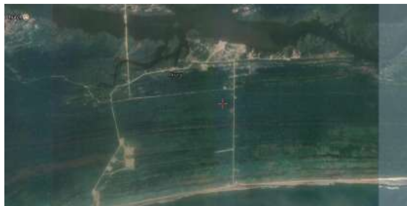
Map showing Ikuru town and its beach

Ikuru Town is located in Andoni Local Government Area in Rivers State, Southern Nigeria. It was founded by King Ikuru Efuya. The Island is small and located close to the bight of Bonny, It features a lengthy white sand beach along the Atlantic Ocean. Ikuru town can be accessed by road and by sea. The beautiful coastlines in Ikuru are an attraction which if properly organised will bring more tourists to the area. The people of Ikuru town are very receptive and their main occupation is fishing.