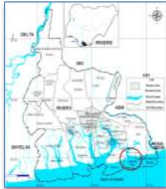
Map of Rivers State showing Andoni Local Government Area Circled.

species of pythons, tortoise etc. and Mineral resources and It is a growing tourist location in Rivers State.