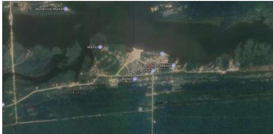
Map showing Ikuru town main town