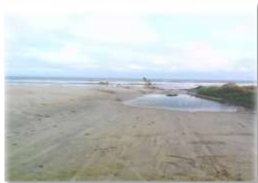
Left; Atlantic Road (Access Road to the Waterfront/Beach), Right: Ikuru Waterfront/Beach